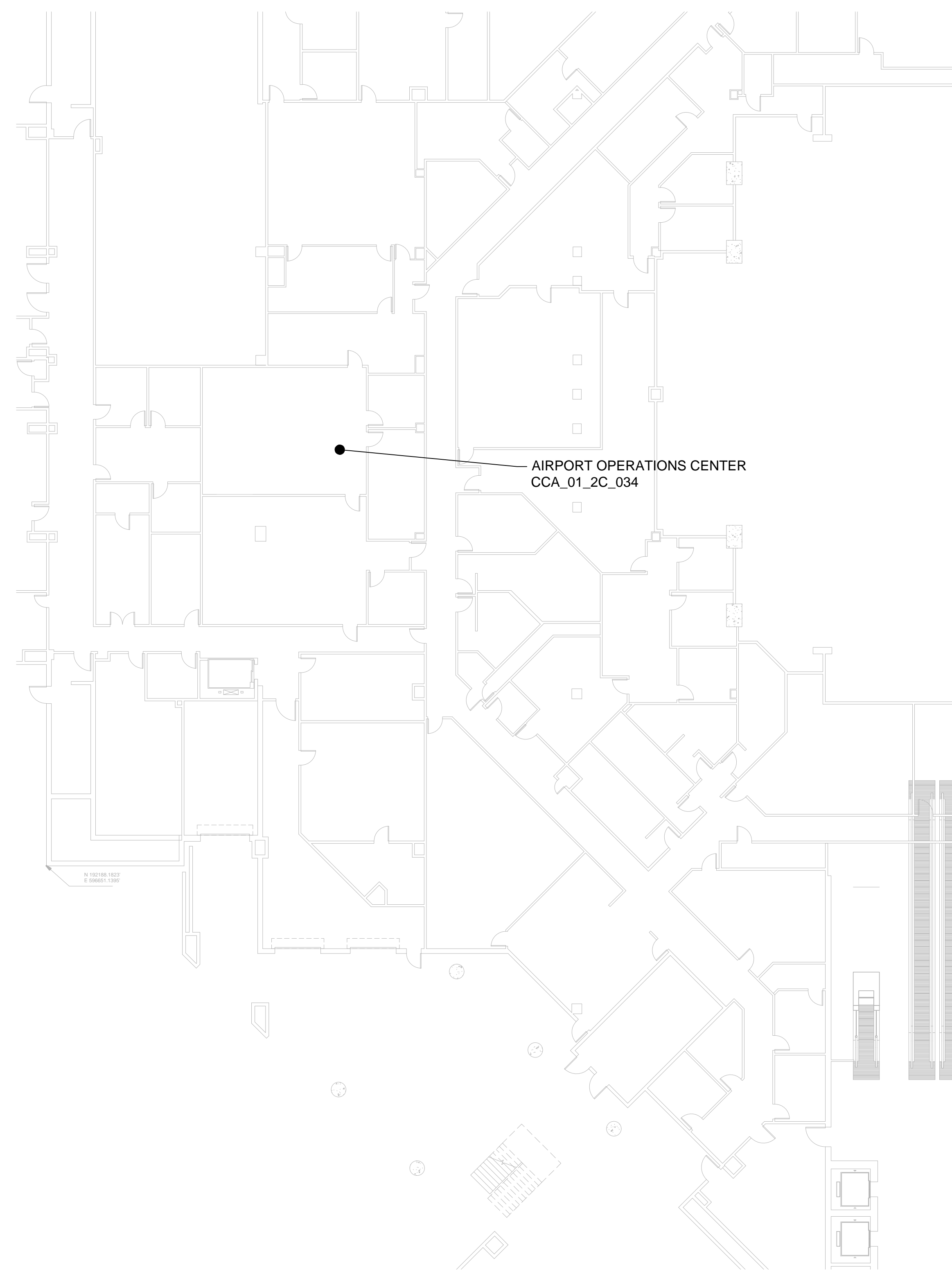
DETAIL 2 CONCOURSE A-LEVEL 1 - ANNUNCIATOR PANEL LOCATION 0 8 16 32' SCALE IN FEET