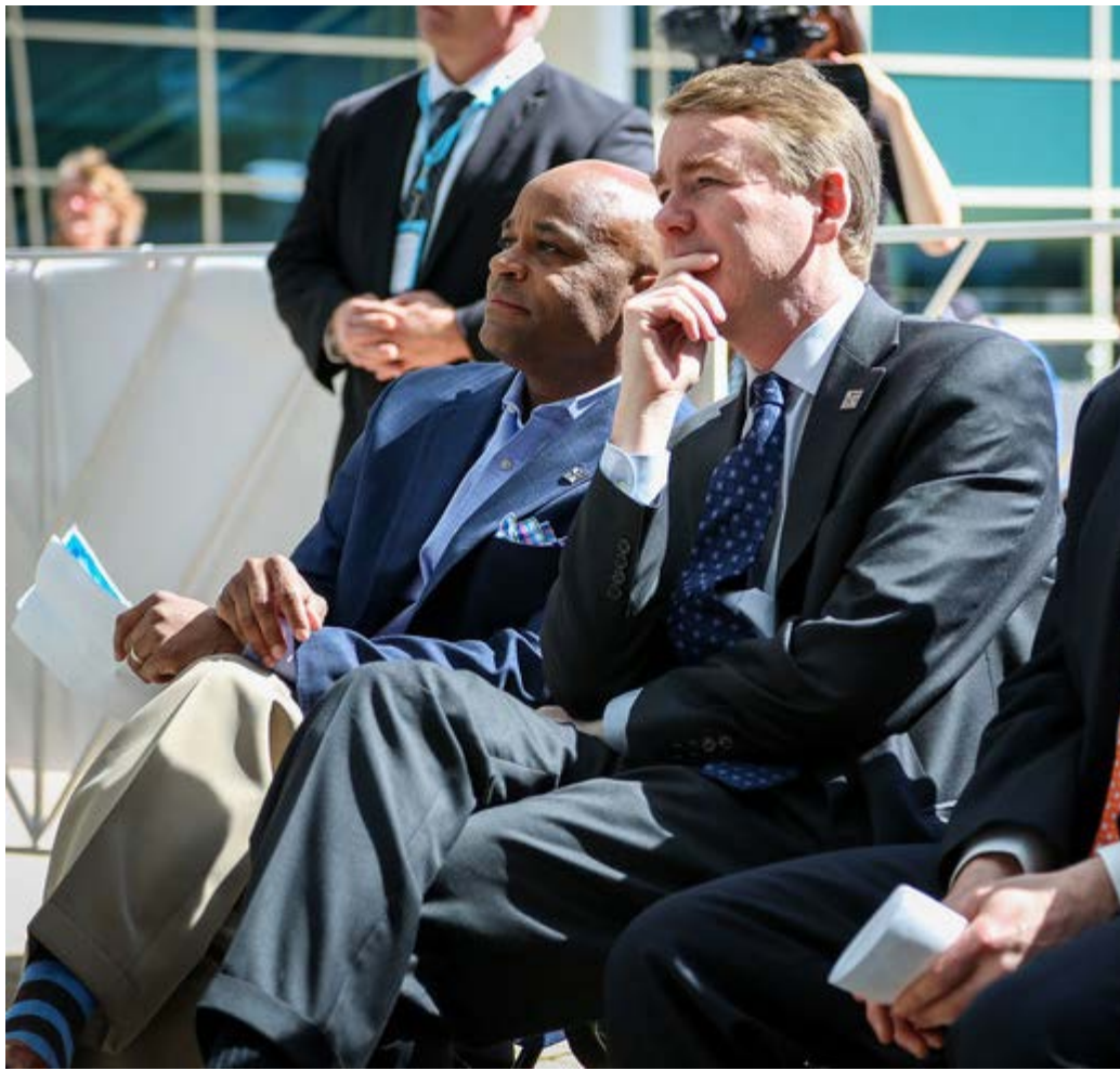
Denver Mayor Michael B. Hancock and Colorado Senator Michael Bennett listen to speeches that marked the opening of the University of Colorado A Line that links Denver's Union Station to Denver International Airport. The rail system debuted on April 22, 2016.