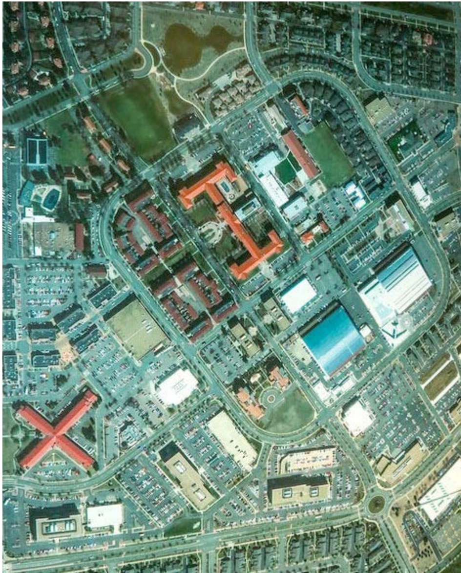
Denver's Lowry neighborhood, captured in an aerial view, is shown in a satellite-produced photograph. The image is part of the "Centennial State from the Air" exhibit at Denver International Airport.