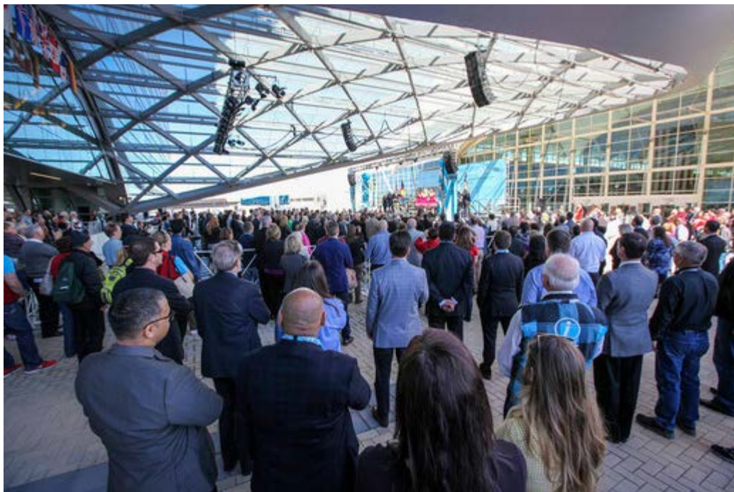
Hundreds of people rode the A Line to the airport on the commuter rail's opening day, April 22. On the plaza between the Westin hotel and Jeppesen Terminal elected dignitaries spoke about the importance of the new rail line and celebrated its completion.