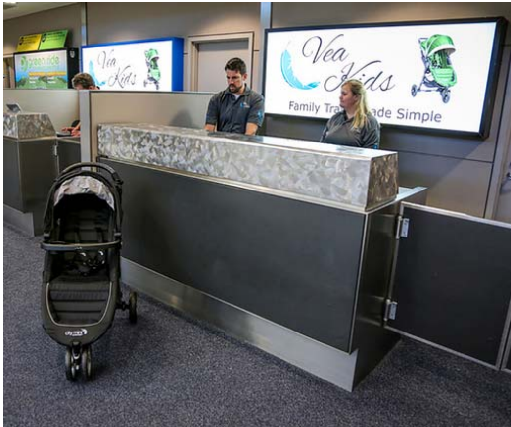
Veia Kids, now open on Level 5 of Jeppesen Terminal in the atrium, offers passengers the opportunity to rent strollers, car seats, and other travel essentials for children.